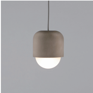
concrete gray + matt opal